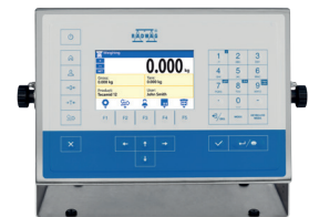
PUE HX5.EX-1 indicator with 5" colour graphic display