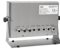
Intrinsically safe communication interfaces and hermetic connectors in stainless steel housing