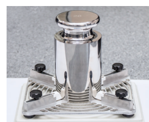
Positioners on an open-workweighing pan