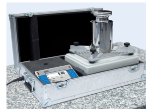
Specially designed suitcase for PM 4Y.KB mass comparator