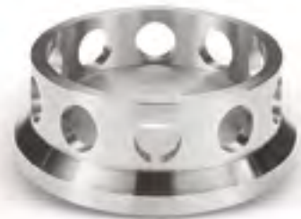
General purpose disintegrating head