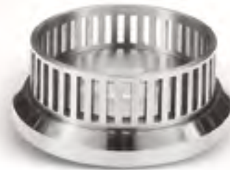
Slotted disintegrating head