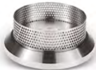
Square hole high shear screen™