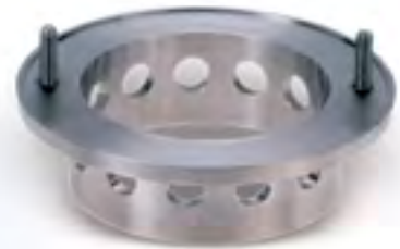
General purpose disintegrating head

The machines are in most cases self-cleaning, a short run between successive operations in water, detergent or an appropriate solvent being all that is necessary. For more thorough cleaning, dismantling is easy and downtime minimal.