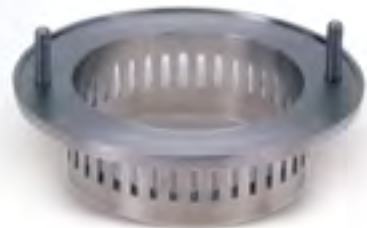
Slotted disintegrating head