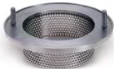
Square hole high shear screen™